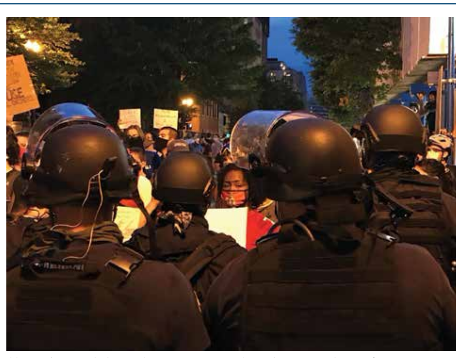
Above: A young lady uses her protest sign to fan police near Lafayette Square, June 3, 2020. Below: A protester stands opposite the line of Soldiers from the 19th Special Forces Group (Airborne) during civil unrest in the nation's capital June 3, 2020.

"I gave her an audience to express her views and we found common ground in shared experiences and a shared desire for a better America. As she left, I think it is fair to say that we each