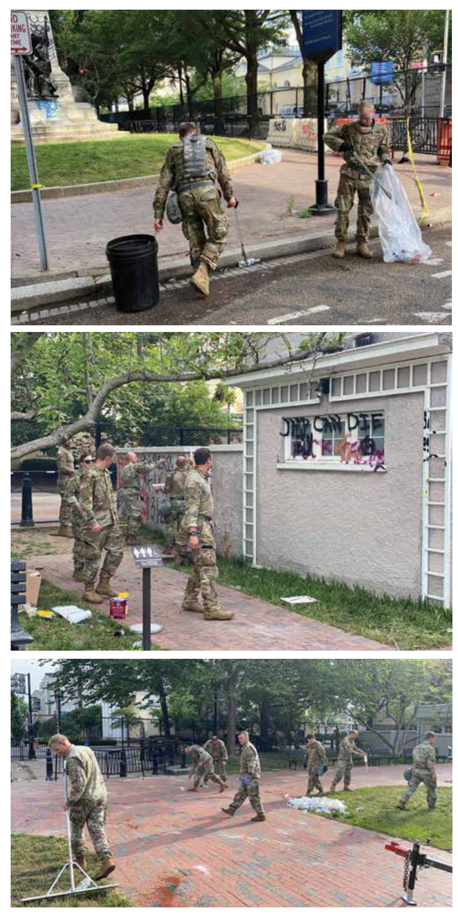
Soldiers in the 19th Special Forces Group (Airborne) help clean-up Lafayette Park, Washington, D.C., June 3, 2020.

on supporting the Parks Police and holding the line to prevent the fence from falling. The situation was very tense for everyone present.