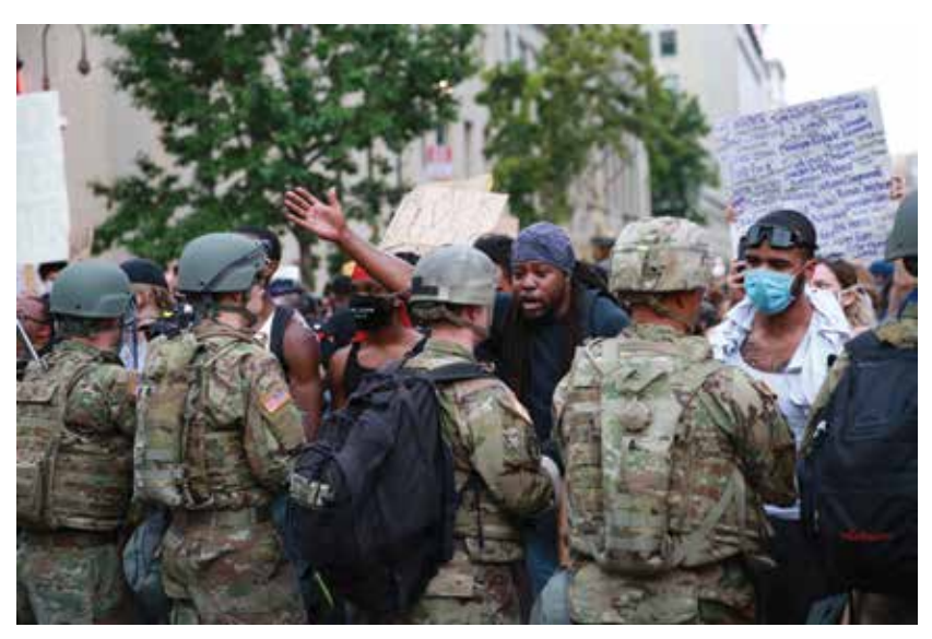
Soldiers with Utah's 19th Special Forces Group (Airborne) create a perimeter around Lafayette Square, in Washington, D. C., June 3, 2020.

One Soldier on the north facing line on 16th St. wrote that on "multiple occasions during the night, people pleading or demanding that their cries