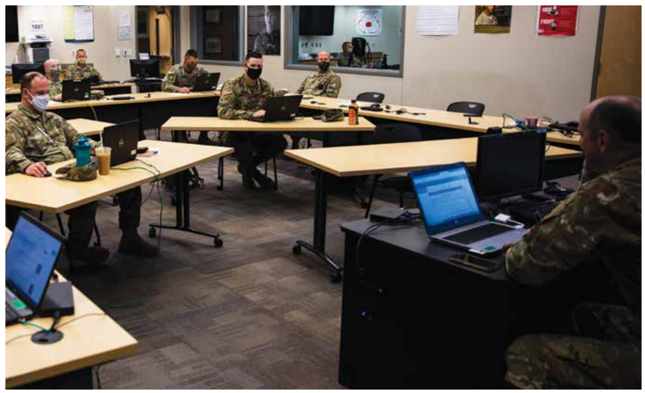
Utah National Guard Soldiers attend Active Guard Reserve Academy as new AGR hires, June 27-30, 2020.